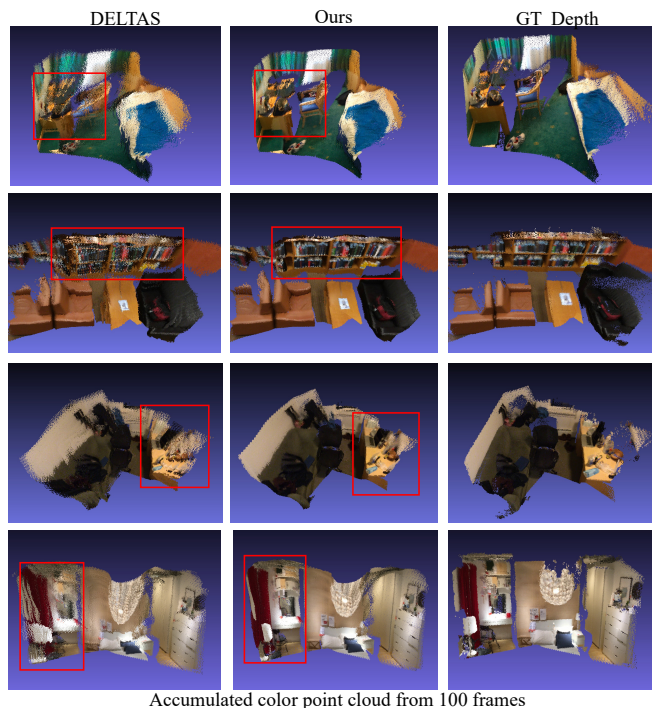
Fig. 3. Qualitative Comparison Accumulated point clouds from 100 frames of ScanNet [2] scenes using estimated depth maps and camera poses. Our model is trained on 7scenes dataset [13] videos without using depth or pose for supervision, then tested on ScanNet without finetuning.

To shed light on these questions, we evaluate the generalization ability of our method in the extreme scenario where after training the depth and optical flow modules themselves get replaced with completely different backbones. If test performance remains high even after swapping to a completely different backbone, it would be a strong indication that our approach has learned data priors that are invariant to the particularities of any single depth/flow estimation method. For this experiment, for the depth module, we use DPT and MiDaS, as before, and additionally include the 2-frame based DELTAS [44] as a third type of depth module. We